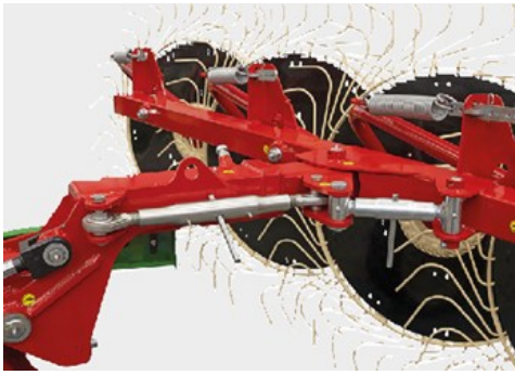
Raking angle and working width adjustment with ratchet jack.