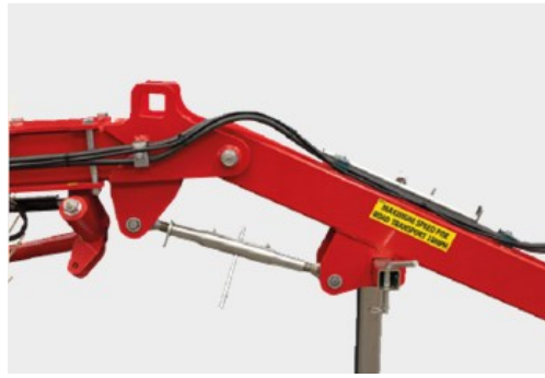
Adjustable hitch with ratchet jack.