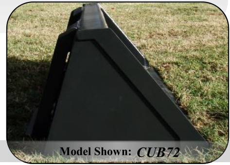
Model Shown: CUB72