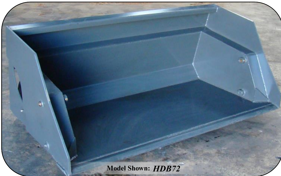
Model Shown: HDB72