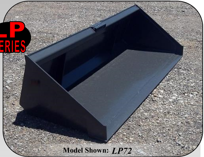
Model Shown: LP72