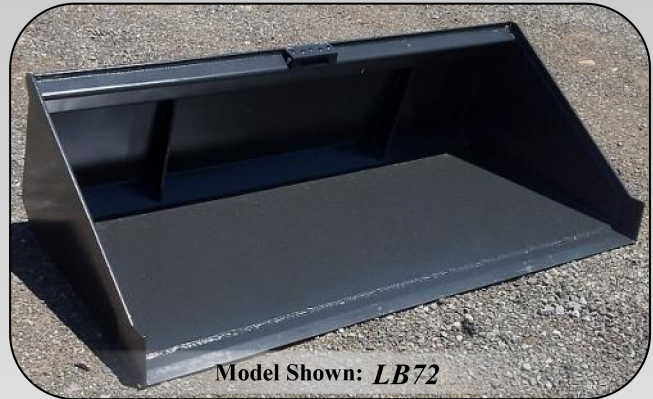
Model Shown: LB72