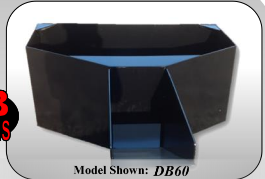
Model Shown: DB60