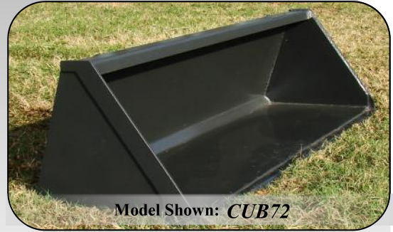
Model Shown: CUB72