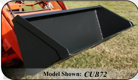
Model Shown: CUB72