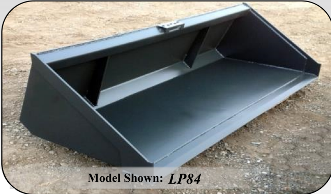
Model Shown: LP84