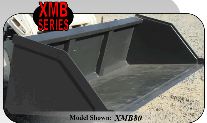
Model Shown: XMB80