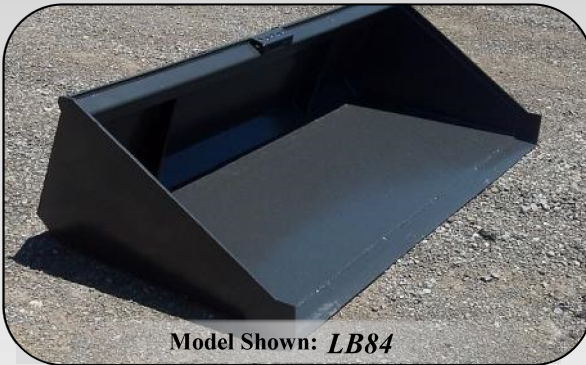
Model Shown: LB84