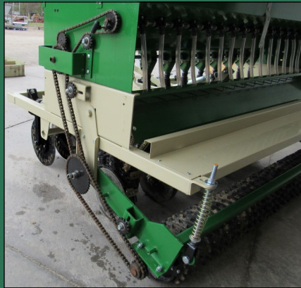
High Precision Ground Drive Seeding System You Stop & Seeds Stop Flowing!