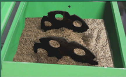
Warm Season Native Grass Seedbox (750-4 ONLY)