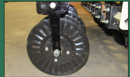
Front Coulter to Help Cut Through Tough Terrain