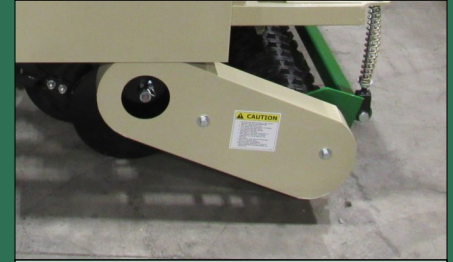
Shearpin for Seedcup Safety Can Also Be Pulled Out to Disengage Seeding System for Use as an Aerator