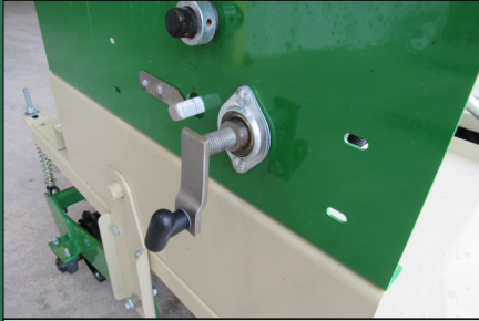
Simple & Highly Accurate Fluted Seedcup Adjustment System