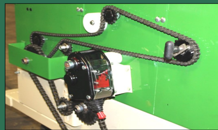
Simple - Smooth adjustment on Native Grass seed box (750-4 ONLY)