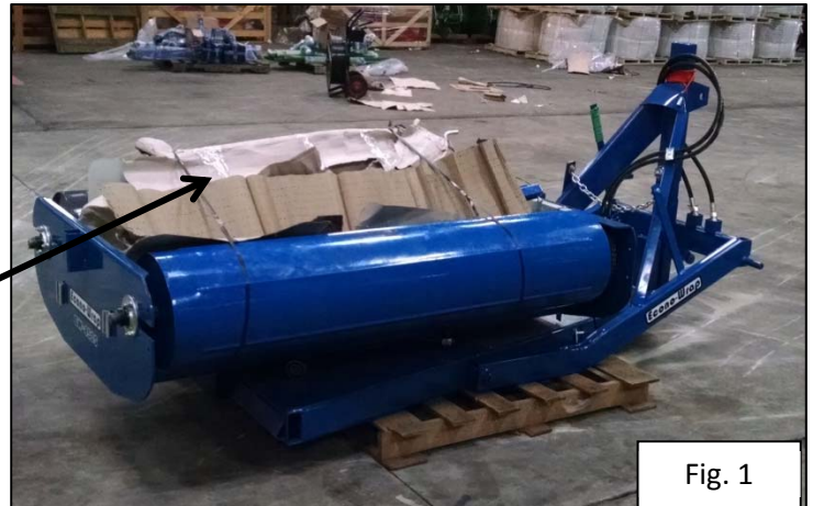
Fig. 1 shows how unit should appear upon delivery. Fig. 2 shows the contents packaged from warehouse.

The following pages explain the light assembly of an EW-450A. Complete assembly should take between 8-15 minutes.